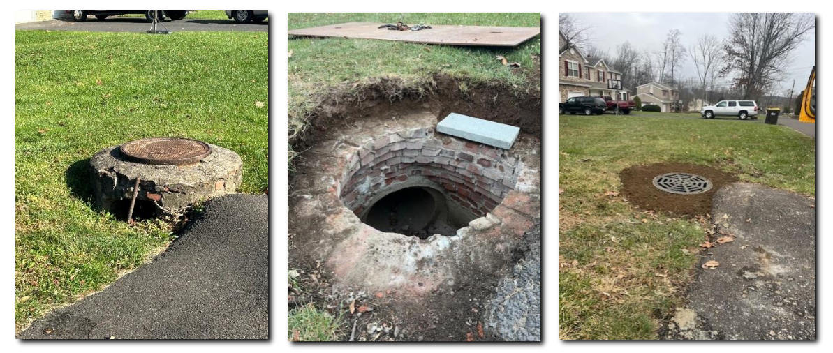
Before and after repairs of storm sewer at #57 W. Peace Valley Rd.

Public Works repaired/ lowered a storm sewer inlet at #57 West Peace Valley Rd.