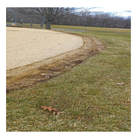
View from second base towards third base on field #3

The PnR department began field prep on field #3 which includes recutting the arc, rototilling, and adding material as needed, and hand raking around the arc. The picture below shows the dead overgrowth cut and prepped for removal.