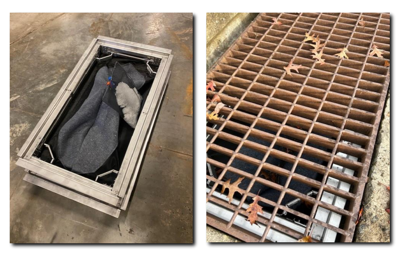
Flexstorm Inlet Bags before and after installation.

Public Works checked drainage (pipes, culverts and inlets) on several occasions after heavy rainfalls, some roadways required debris removal (washouts, down trees, etc.). We installed Flexstorm Inlet Filter Bags in inlets along Upper State Rd. as part of our MS4 requirements.