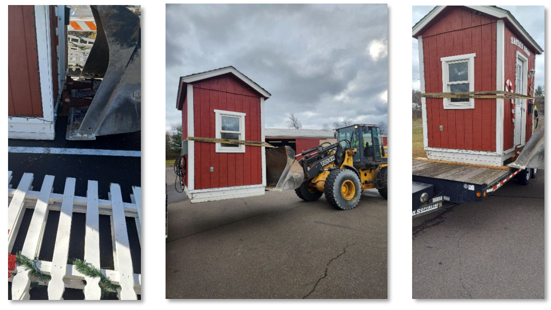
Forks placed under frame

The Parks and Recreation Department rechecked the Santa House and after final inspection moved the Santa House and all accessories and set up in the New Britain Village shopping center. The Monday following the event PnR moved everything back to storage at the Public Works garage. The pictures below show the process of how the House is loaded and transported.