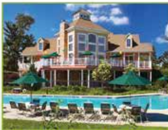
Heritage Orchard Hill - Clubhouse 1 Applewood Drive, Perkasie, PA 18944