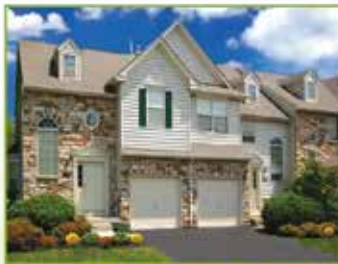
Heritage Summer Hill 4000 Lily Drive, Doylestown, PA 18902