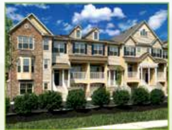
Heritage Pointe Village Way, Chalfont, PA 18914