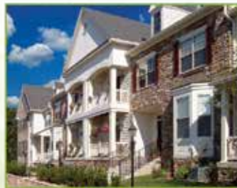
Heritage Greene 807 Ridgeview Court, Sellersville, PA 18960