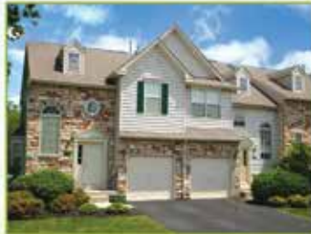
Heritage Summer Hill Signature Drive, Doylestown, PA 18902