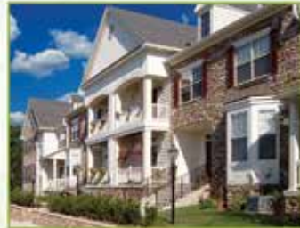
Heritage Greene 807 Ridgeview Court, Sellersville, PA 18960