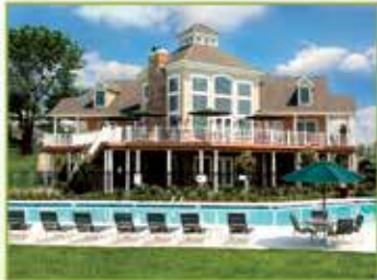
Heritage Orchard Hill - Clubhouse 1 Applewood Drive, Perkasie, PA 18944