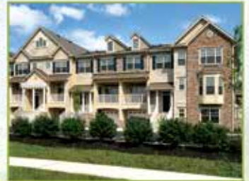
Heritage Pointe Village Way, Chalfont, PA 18914